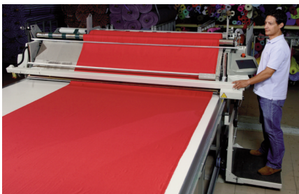
GERBERSpreader™ tension-free material spreading system

NOTE: Configurations vary according to options selected. Specifications are subject to change without notice.