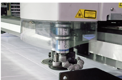
Vortex knife cooler