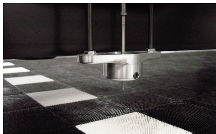
Fabric Drill - up to 12.7 mm (0.5 in) diameter