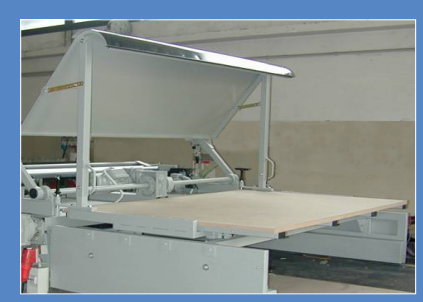
Optional trailer for flat folded material up to 300 kgs.