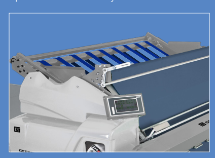
Optional extra large cradle for high-loft materials