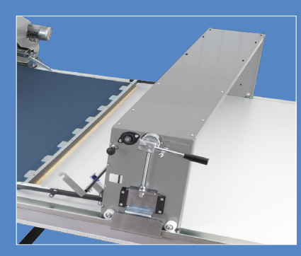
Optional end catcher system

The GERBERspreader 250s spreads material rolls weighing up to 250 kg (550 lbs.) at speeds up to 100 meters per minute without tension. Precision selvage and end alignment technology maximizes material utilization.