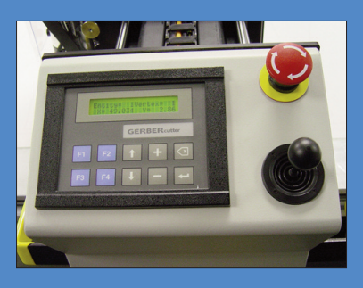
The easy-to-use keypad controls many machine functions at the cutter.

The DCS 1500 GERBERcutter® is a compact, high-speed, single- or low-ply, static table cutting system, designed to cut a wide variety of materials. The system is most suited to cutting samples, prototypes, or short production runs. Its cutting accuracy is measured in millimeters and it cuts at speeds up to 1.1 meters per second (45 inches per second).